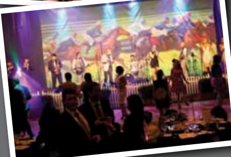
Above (from top):